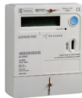
General Purpose Rate Prepayment Meter

Here are some examples of the information available on your meter. Depending on your meter type you should be able to scroll through all the available screens by pressing the main button repeatedly.