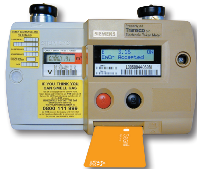
An example of a gas meter

To move through the screens, keep pressing the red button. You might need to insert your gas card to access more detailed information.