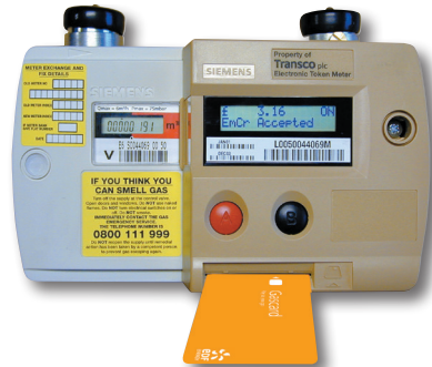
An example of a gas meter

To move through the screens, keep pressing the red button. You might need to insert your gas card to access more detailed information.