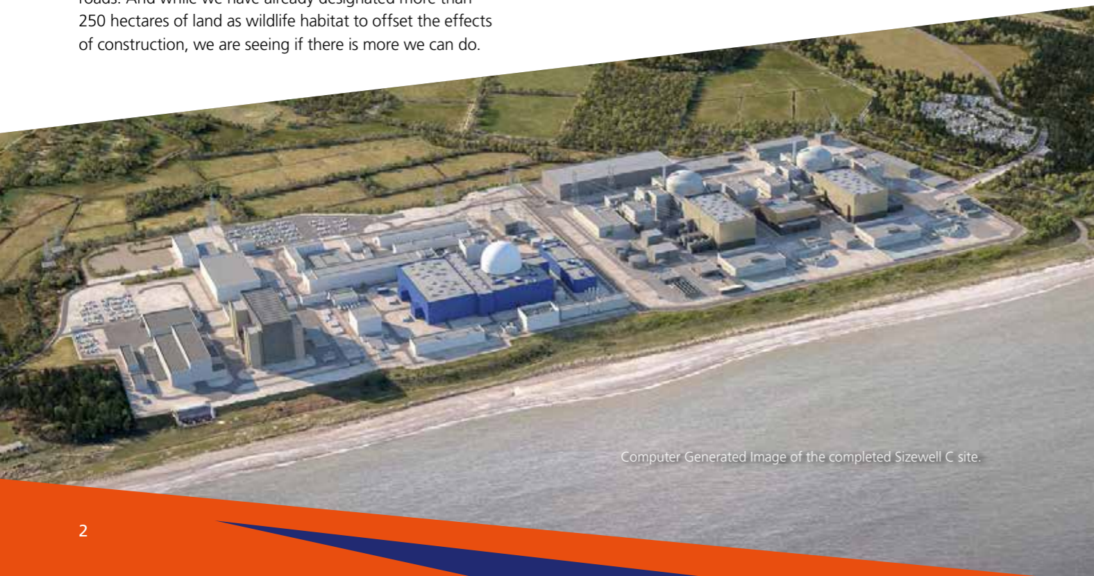
Computer Generated Image of the completed Sizewell C site.

Sizewell C will help to address some of the urgent challenges this country faces and that is why I truly believe it can do the 'power of good for Britain'.