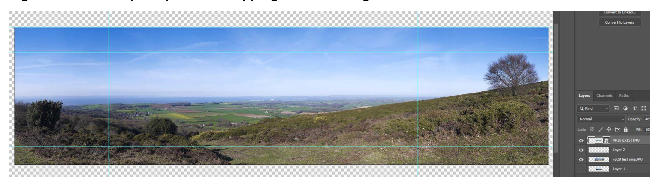
Figure 1: Photoshop template for cropping baseline image to size