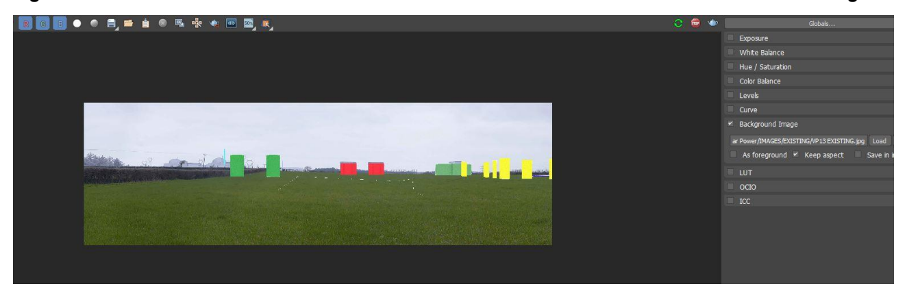
Figure 3: Autodesk 3DS Max render from camera matched to reference models and baseline image

As part of this process the 'warped old style camera' settings were used to match the cylindrical projection of the baseline panoramic image and allow accurate matching of reference points.