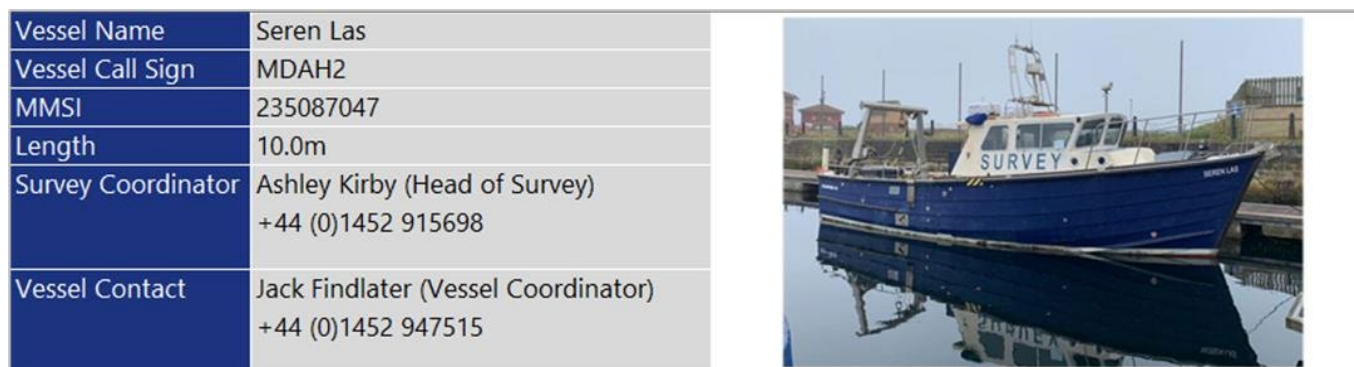
Table 1 Vessel Details