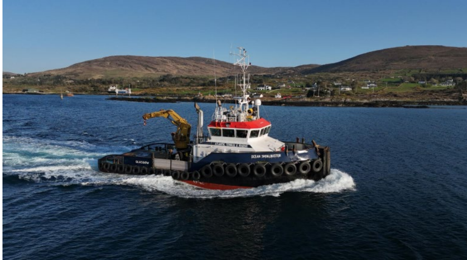
Figure 7: Ocean Shoalbuster