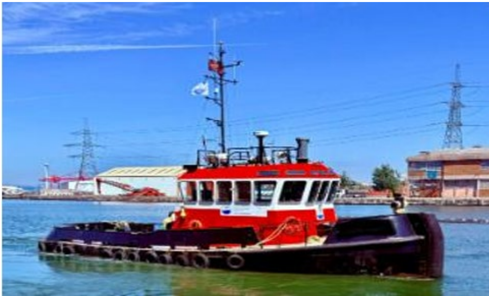
Figure 14: Veronica D

All vessels listed will be restricted in their ability to manoeuvre when towing and on operations in the works area, and will display the signals prescribed by the International Regulations for Preventing Collisions at Sea, 1972 (as amended). Vessels are requested to pass at a safe speed and maintain a safe distance from all these operations. All vessels will keep a listening watch on VHF channel 16 with a working channel of 17.