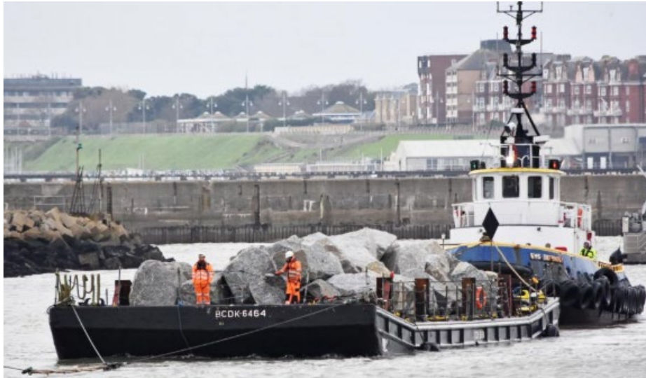
Figure 11: BCDK 6464