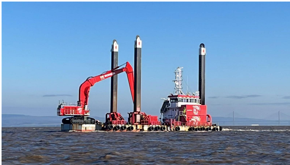
Figure 8: Capall Mara