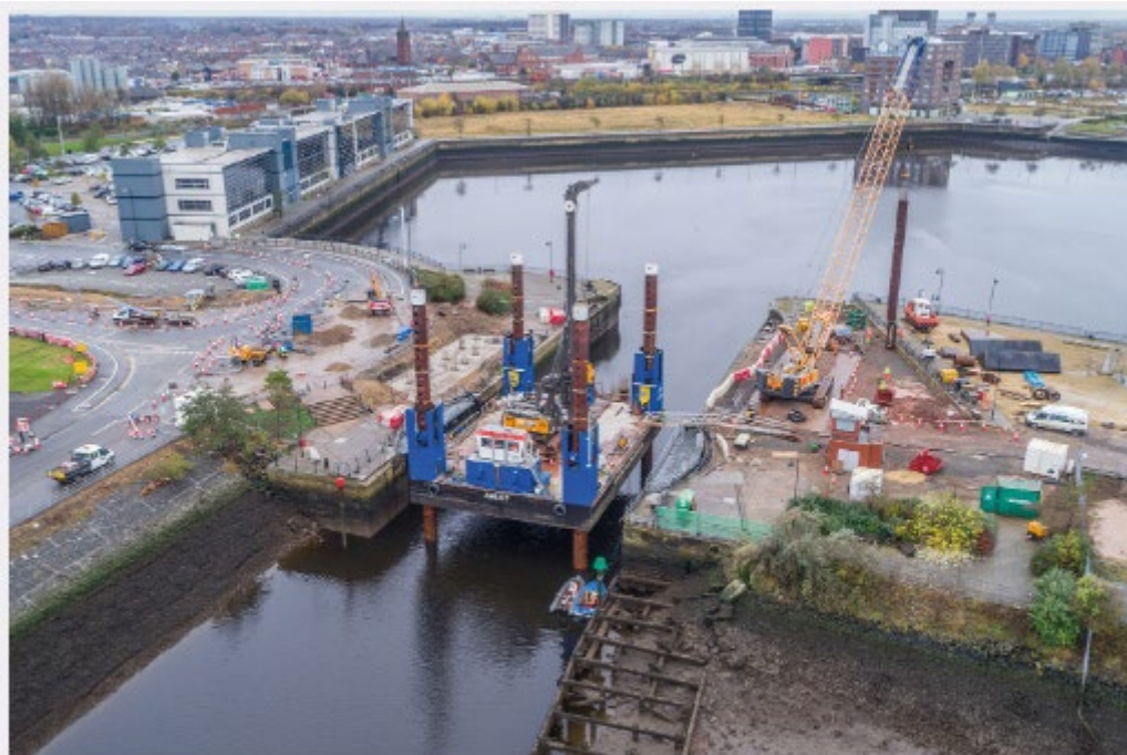
MJU2417 (modular) – Payload 300 ton