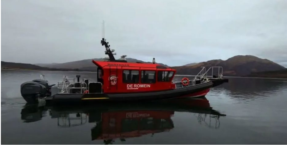
Figure 10: Manannan