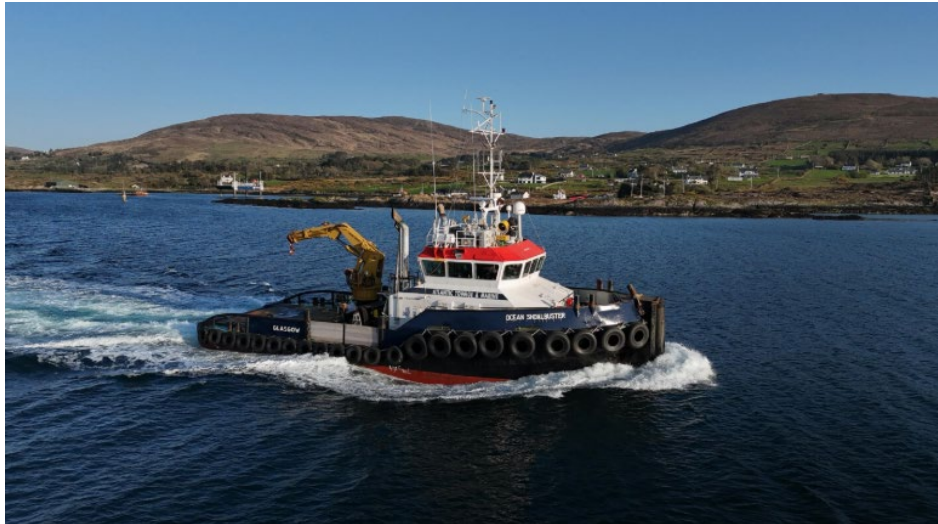
Figure 7: Ocean Shoalbuster