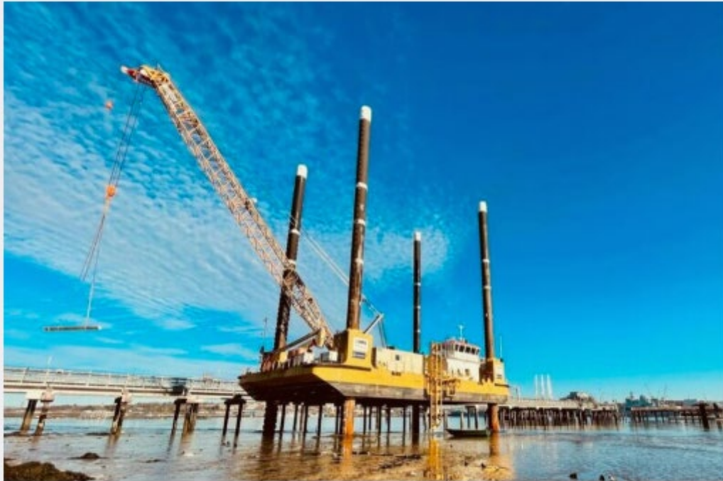
JU3620 (monuhull) – Payload 600 ton