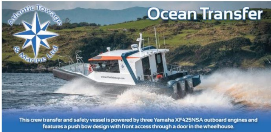
Figure 4: Ocean Transfer