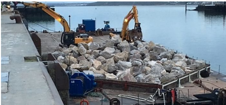
Figure 12: Mormaen 15