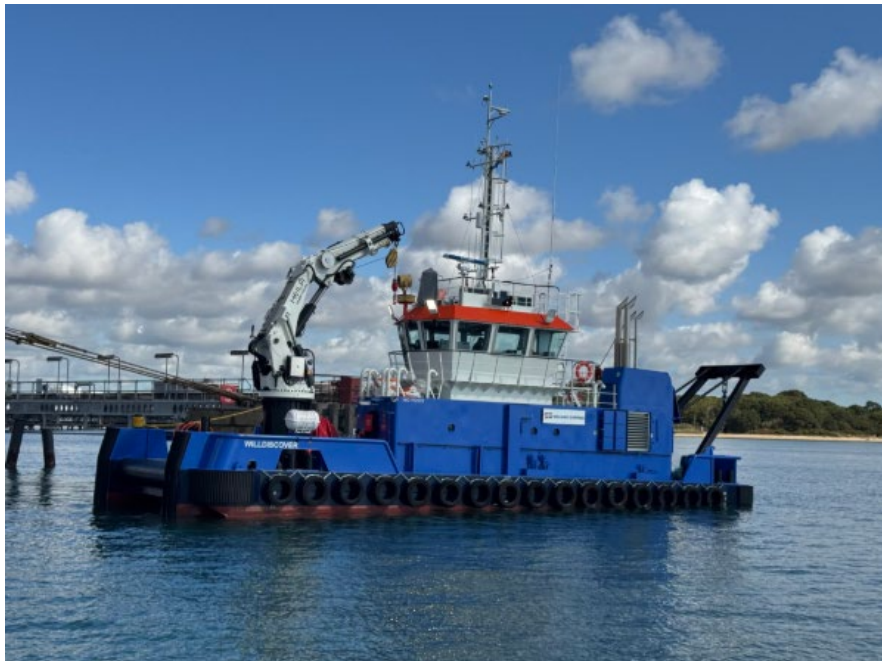
Figure 14: Willdiscover

All vessels listed will be restricted in their ability to manoeuvre when towing and on operations in the works area, and will display the signals prescribed by the International Regulations for Preventing Collisions at Sea, 1972 (as amended). Vessels are requested to pass at a safe speed and maintain a safe distance from all these operations. All vessels will keep a listening watch on VHF channel 16 with a working channel of 17.