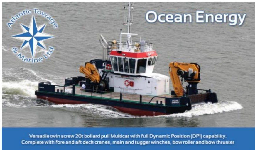
Figure 5: Ocean Energy