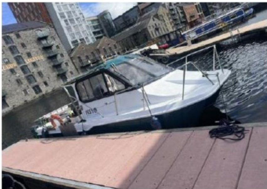
Figure 6: Nearshore Explorer