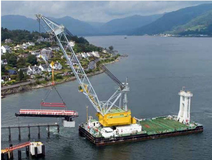
Figure 13: Lara 1