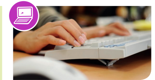
Bridgwater Victoria Park Community Centre received funding towards a Digital Inclusion and Job Club which provides a safe and friendly environment to access the web for tasks such as job searches, learning computer skills, registering for welfare and benefits and much more. Westfield Church has also received funding to build a permanent Community Street Cafe.