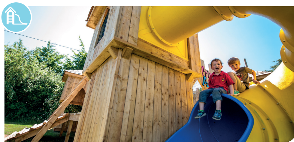
Williton In addition to the new primate enclosures, play equipment and a summer marketing campaign at TropiQuaria Zoo, the Parish of Williton has also received funding for a new sports and community pavilion.