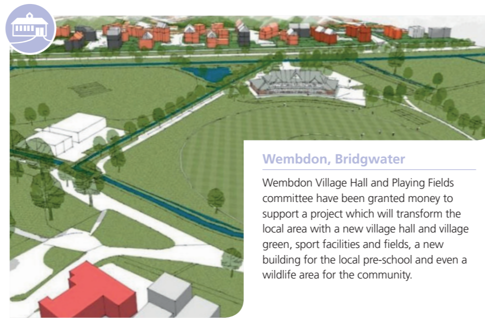
Wembdon, Bridgwater Wembdon Village Hall and Playing Fields committee have been granted money to support a project which will transform the local area with a new village hall and village green, sport facilities and fields, a new building for the local pre-school and even a wildlife area for the community.

EDF Energy has committed a total of £20 million towards a Community Fund which has already granted financial support to a number of exciting projects across Somerset.