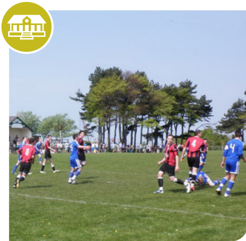
Watchet The village of Watchet has received funding for two projects with the football and cricket pavilion placing a successful bid for improvements to its facilities and Watchet Boat Museum and Visitor centre being granted funds for an expansion to help provide visitors to the area with a new focal point and gateway into Watchet.