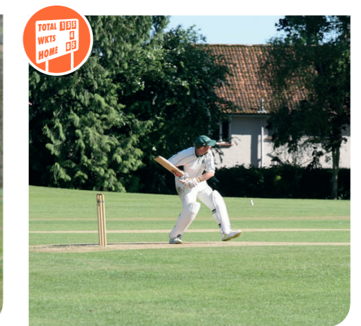
Kilve The Cricket Club in the village of Kilve has received funding for upgrades to their scoring and storage facilities, allowing them to extend the training sessions they run during the week.