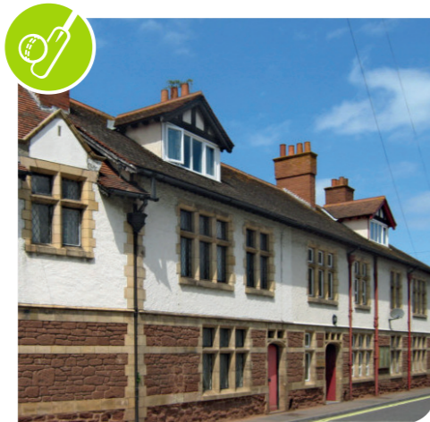
Cannington The Parish of Cannington also has CIM fund money set aside for projects within their community. So far funding has been spent on new cricket equipment and the Village Hall improvement project, which now offers 2 separate areas for use, each with its own kitchen.