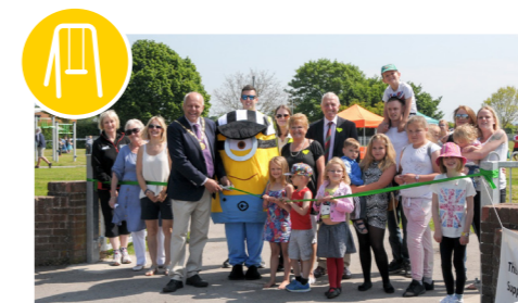
Sydenham, Bridgwater Sydenham and Bower Health and Wellbeing Group were successful in a bid for funding towards improvements in Coronation Park. The new park had its grand opening in May to launch the new play facilities which include a toddler and junior zones, a zip wire, trampoline, gliders, slides and swings. The East Bridgwater Together Team has also received funding towards support services and community events.