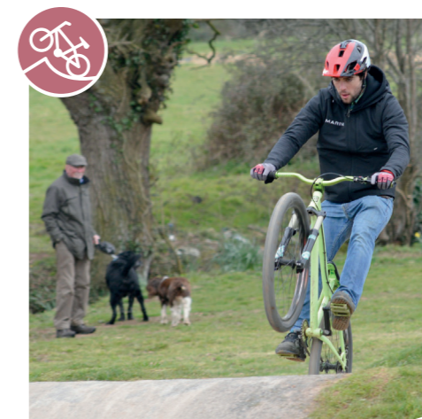
North Petherton North Petherton Plaing Fields has received funding for new play equipment and a BMX track. The opening ceremony took place in March this year and the area is now open for use.