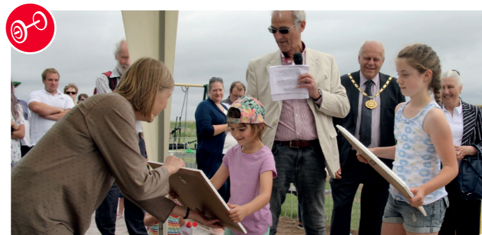
Otterhampton The parish of Otterhampton has received funding to improve its village green, including a new play area and outdoor gym, which is now open.